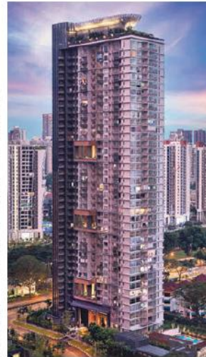
Above: Twin VEW was successfully launched last May, with 86 per cent of units sold in the first weekend. Left: Alex Residences at 28 Alexandra View.

As a leading builder, CCDC has enjoyed 27 years in the industry. It has successfully delivered 69,016 residential units, 16 educational projects, and many quality projects for commercial, hotel, healthcare and infrastructural sectors.