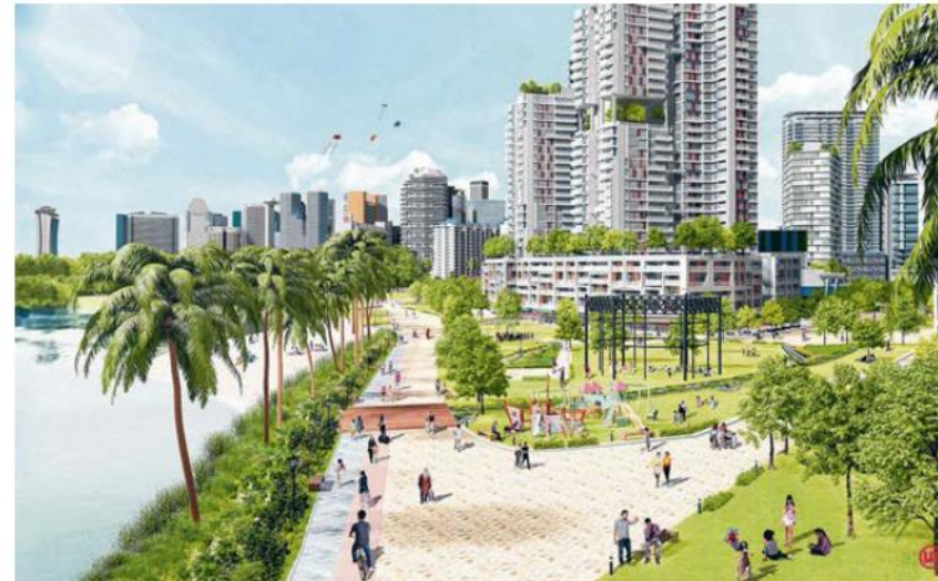
An artist's impression of the Kallang Riverside Park. The area will be car-lite, meaning only one parking space will be provided for every two residences - 50 per cent below the current minimum standard.

The SLA and National Environment Agency (NEA) said in a statement late on Thursday that the remediation works are unlikely to pose any health risks to the community. The works will be carried out in enclosed facilities, with proper control measures and in line with international standards and local laws. The works will be done by a qualified contractor, who will be supervised and